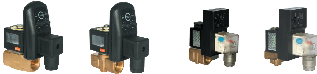
type : XY-720